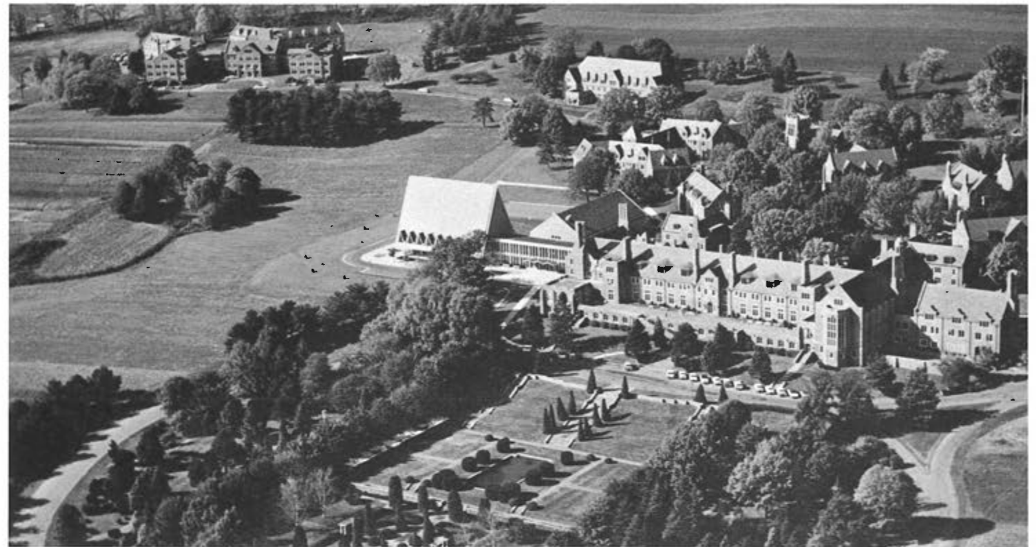
Aerial view of the Masonic Homes at Elizabethtown. The view shows the Grand Lodge Hall and other structures in the central section. It only shows a few acres of the 1500 acres that make up the Masonic Homes.

"I will need your help, assistance and cooperation, and that I request, but my prayer is that I may have the blessing of the Great Architect of the Universe."