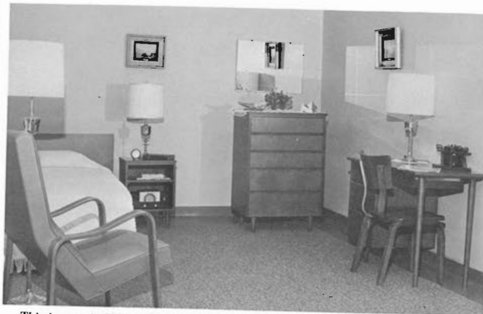
This is a typical Guest Room today at the Masonic Homes, following a $100,000 refurnishing project—paid for by the Guest Fund. The new furnishings include: lamps, beds, chairs, window shades, chests, mirrors, night tables, desks, rugs and draperies.

More than two-thirds of every Masonic dollar expended annually by our Grand Lodge goes not for the maintenance of our fraternal organization but for the charitable work at our Masonic