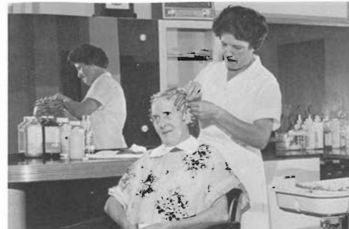
The beauty shop is an important service at the Masonic Homes. A Guest is shown fully enjoying all of its benefits.