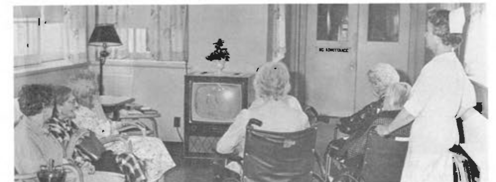
Hospital Guests enjoy baseball via television. Sets are located throughout the hospital and positioned for convenient viewing.