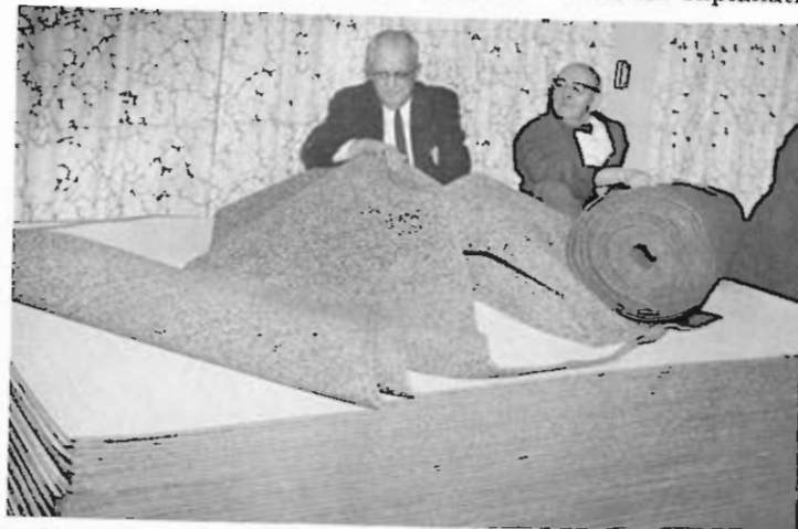
Two Guests at the Masonic Homes inspect $25,500 worth of new rugs that have been installed in all the Guests' rooms—purchased with moneys that Masons contributed to the Guest Fund.

I hope many will make their contributions substantially larger this year than ever before and thus help to create, "beyond the budget," the happiness and smiles so necessary for the kind of a life we want our Guests, both young and old, to have.