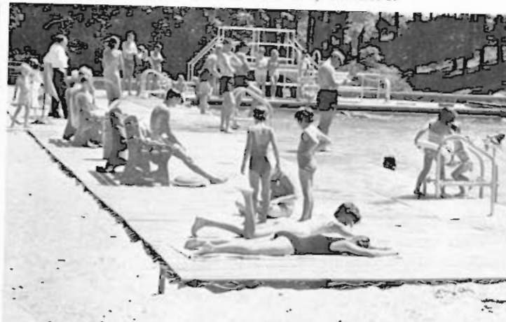
A modern swimming pool is maintained for children and adult Guests at the Masonic Homes. Money for life guards, swimming instructors and general maintenance is provided by the Guest Fund.