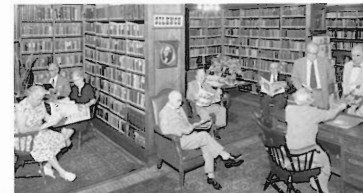
A library, with plenty of current magazines and daily "home town" newspapers, is an important service provided Guests at the Masonic Homes.

This could go on and on. If you need further proof of the need for the Guest Fund, visit the Masonic Homes.