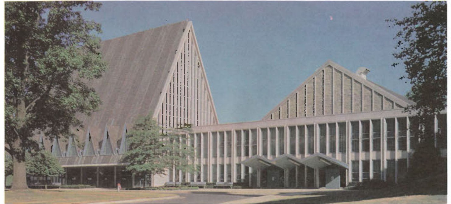
The facilities in the Masonic Temple and Recreational Buildings at the Masonic Homes will be available for many of the occupational therapy programs that have been inaugurated for our Guests. The Recreation Building includes

the George H. Deike Auditorium with a seating capacity of 550. On the ground floor is a recreation room with a stage and dance floor. The entire building is air-conditioned. The Masonic Temple has a large dining room on the first floor.