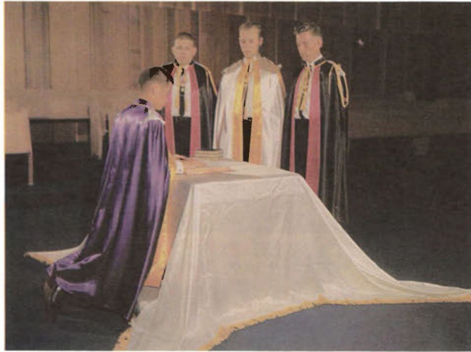
DeMolay teaches young men reverence for God and the highest respect and regard for parents and womanhood. This is a typical DeMolay altar scene. The Grand Lodge encourages Masonic Lodges throughout the Jurisdiction to assist this youth organization.