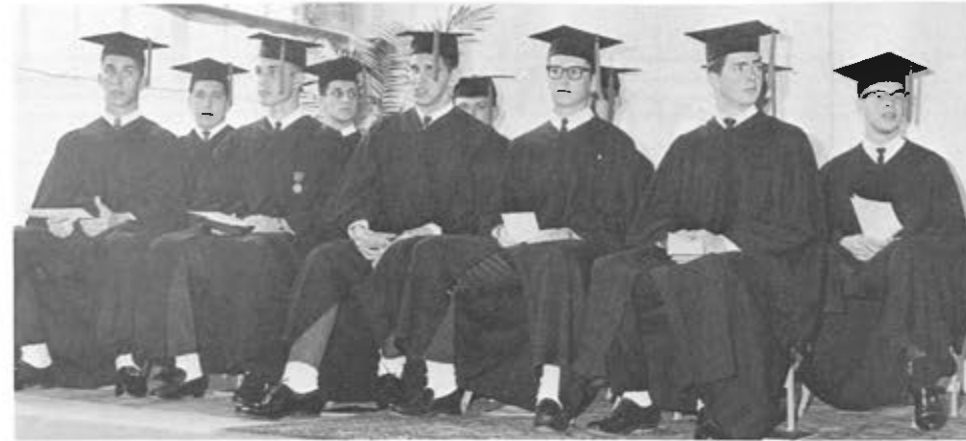
The 1963 graduates of Patton Masonic School anxiously await their diplomas. Many of the graduates will go to college, while others have obtained positions in vocational trades.