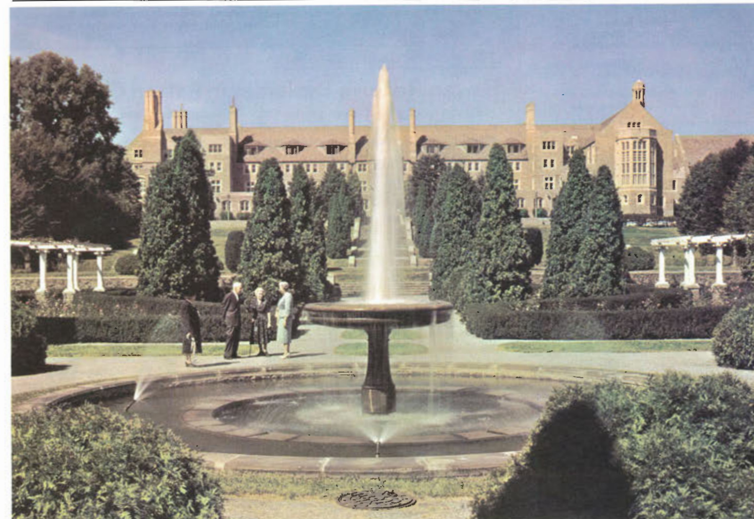
Looking through the formal gardens to Grand Lodge Hall at the Masonic Homes at Elizabethtown, Pa.