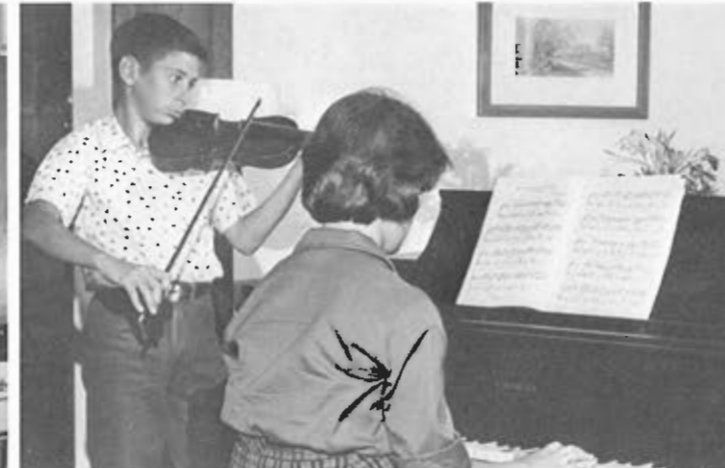
Music lessons are important opportunities for all children. Those at the Masonic Homes are given this opportunity.