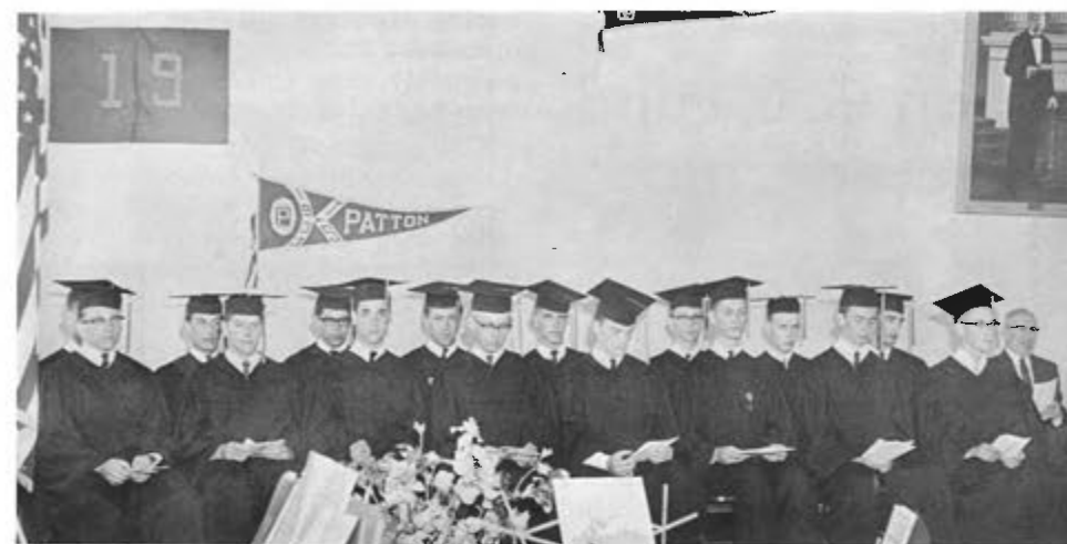
The 1965 Graduating Class of The Thomas Ranken Patton Masonic Institution for Boys. Of the sixteen graduates, several will go on to colleges as others take positions in the various trades for which they were trained.

If you have misplaced, or have not received, a self-addressed envelope for your annual contribution to the Guest Fund for the Masonic Homes at Elizabethtown, send your check direct to: Superintendent, Masonic Homes, Elizabethtown, Pa. 17022. Be sure to note your Lodge Number in order that your Lodge will be credited with your contribution.