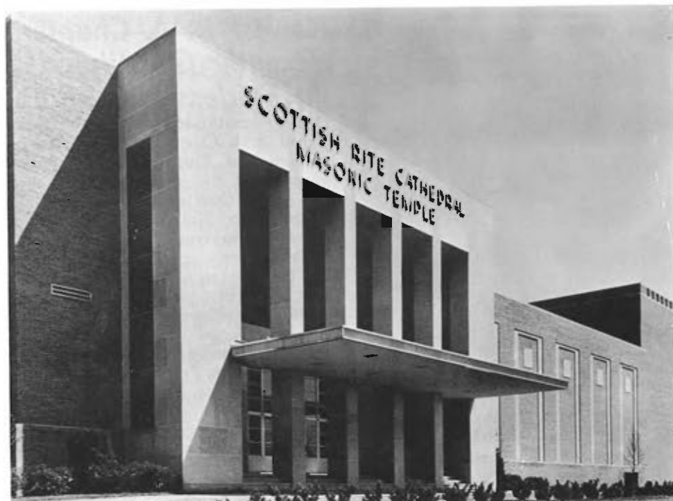
The spacious and comfortable air-conditioned Scottish Rite Cathedral and Masonic Temple, Harrisburg, Pa., site of Ninety-fourth Convocation of Pennsylvania Council of Deliberation on Friday, July 9, 1965. The Special Communication of Grand Lodge, June 1, and the June Quarterly Communication of Grand Lodge, June 2, were also held here.