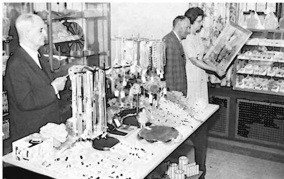
A favorite stop now for visitors to the Homes is the new Gift Shop near the Dining Room in Grand Lodge Hall where you will find an inventory of hundreds of pieces of handiwork, representing endless hours of craftwork performed by our Guests at the Homes in the various hobby shops now part of the occupational therapy program. This is but one of the programs at the Homes made possible by your support of the annual Guest Fund appeal.

When a Brother petitions for membership only, he must present a Lodge Certificate under the seal of the Lodge of which he was last a member, a Transfer Certificate as herein provided, or furnish other satisfactory evidence that he is in good Masonic standing and, except when a Transfer Certificate is submitted, that he is not a member of any Lodge."