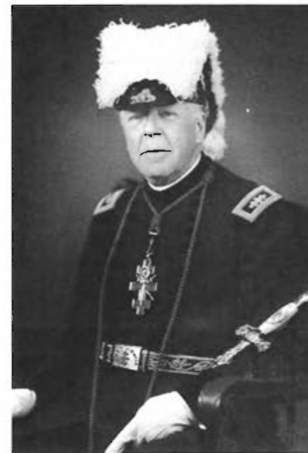
Bro. Wilbur M. Brucker M. E. Past Grand Master Grand Encampment, Knights Templar United States of America

Bro. Brucker served as Secretary of the Army for five and a half years, the longest tenure of any Secretary since Stanton during Lincoln's administration.