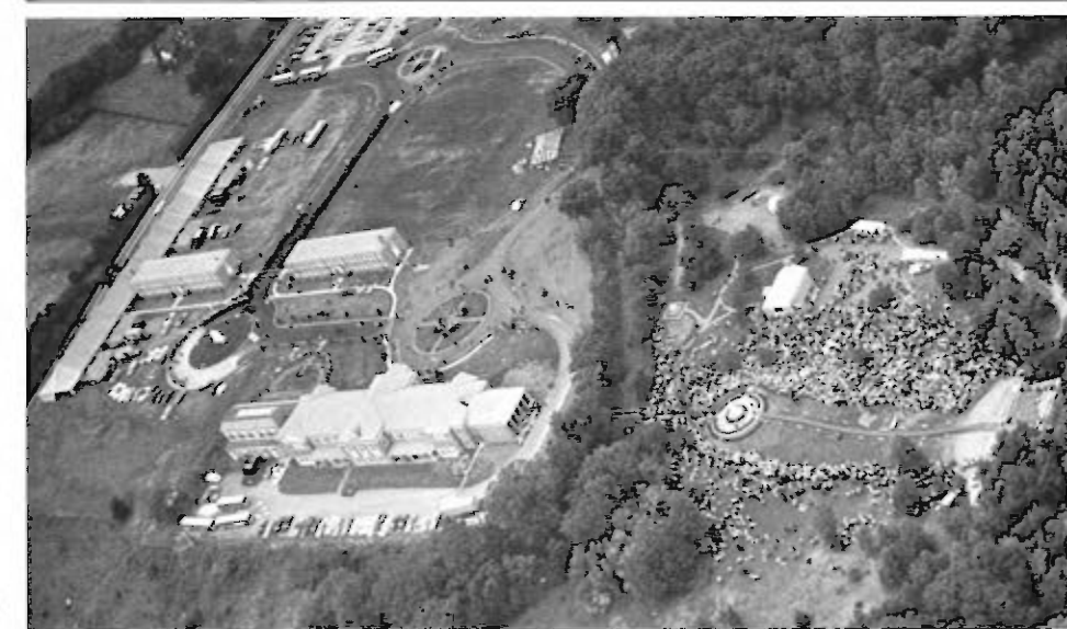
An aerial picture showing the complex of Freedoms Foundation on the afternoon of the dedication of the statue. On the left can be seen the large long tent used for the Dedication Banquet. The site where the statue has been erected is on the right at the entrance to the Congressional Medal of Honor Grove. The picture, taken at a distance, does reveal the large crowd shown in some of the open area, near the statue and platform. Between the two long buildings, to the right of the tent, can be seen the formation of the Processional made up of several hundred Masonic Officers, Grand Lodge guests, and officials of Freedoms Foundation.