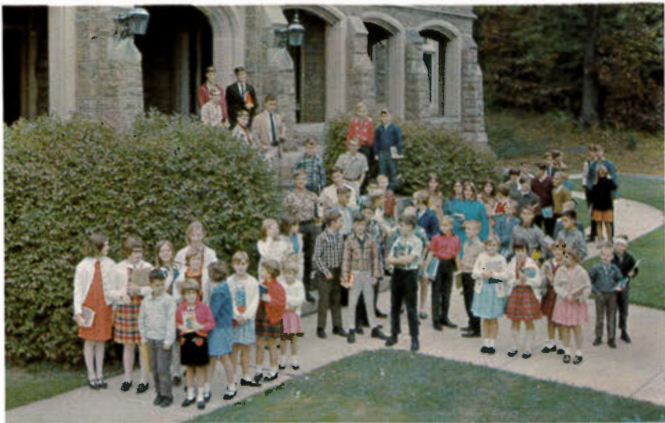
All set for another day of "reading, riting 'n rithmetic" in their respective classes in the Elizabethtown Public Schools, are the Children, Guests at the Masonic Homes. Your contribution to the Guest Fund makes it possible to provide "that something extra" for these wonderful boys and girls of all ages.

An application has been filed with the Internal Revenue Service for the registration of the foundation as a Charitable Foundation exempt from federal taxes under the Internal Revenue Code.