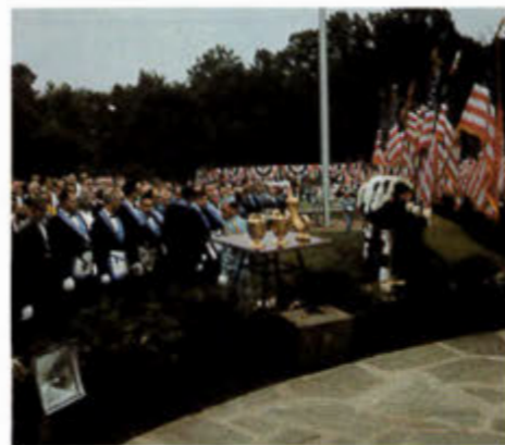
Shown on the left is a picture of some of the 800 Symbolic Lodge Officers who participated in the Masonic Procession at the dedication of the Washington Statue, with a view of the main platform in the background and the three Golden Vessels which contain the Corn, Wine and Oil used in the ancient Masonic Ritual. The picture in the center was taken from the statue and shows the Grand Sword Bearer,