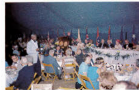
was taken inside the huge tent where the Dedication Banquet was served in the early evening. To the right is a picture of thirteen young men from Chester Chapter, Order of DeMolay, who took part in the Processional, each carrying a flag of one of the Thirteen Original States.