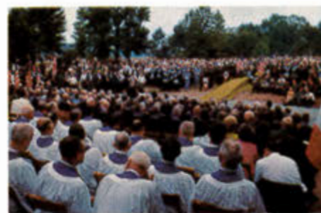
On the left is a view taken from the rear of the main platform erected at Freedoms Foundation and showing the vast gathering of people jammed in the area between the platform and the statue. A few of the members of the Scottish Rite Choir of the Valley of Harrisburg may be seen in the foreground. The picture in the center

The instruments will be serviced and restored from monies in the Guest Fund and immediately put into active service.