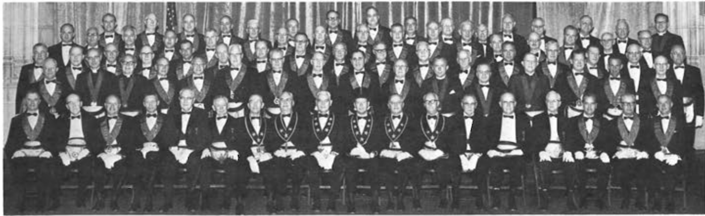
Picture of Grand Lodge Elected and Appointed Officers assembled in the East of Shopland Hall, Masonic Temple, Scranton, prior to the Quarterly Communication of Grand Lodge, June 5, 1968.