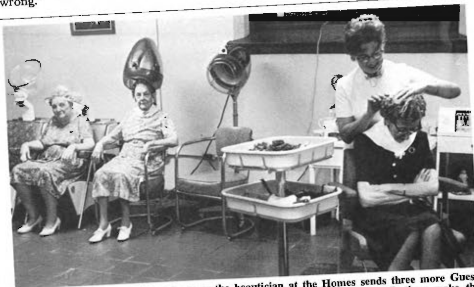
Two under the dryers and one to go as the beautician at the Homes sends three more Guests on their way, happy with their favorite hair-do. Your Guest Fund contributions make this very popular beauty parlor possible.

The Grand Lodge, through its Committee on Masonic Culture, is both proud and pleased for the services being performed by the several District Chairmen.