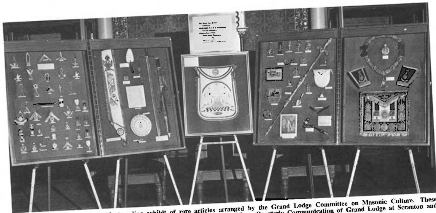
Shown above is the new portable traveling exhibit of rare articles arranged by the Grand Lodge Committee on Masonic Culture. These specially designed cases have thus far been placed on exhibit during the June Quarterly Communication of Grand Lodge at Scranton and for the 100th Anniversary of Fritz Lodge, No. 420, at Conshohocken, Pa.