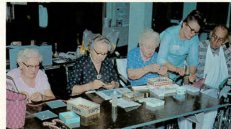
Guests, confined to hospital, also participate in the Hobby-Craft program made possible by the Guest Fund.