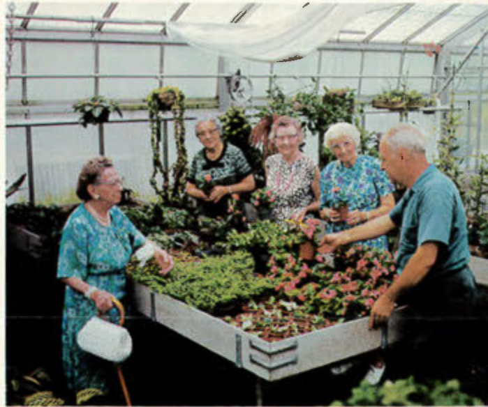
Guests helping themselves to a potted plant, from the new greenhouse, to take back to their rooms.