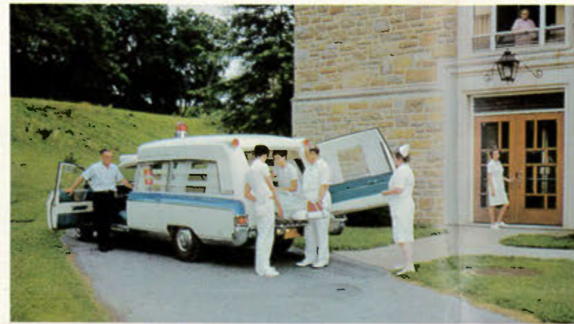
A fully-equipped ambulance, always ready and waiting to accommodate the needs of the Guests, is just one of the several necessary items made possible by the Guest Fund.