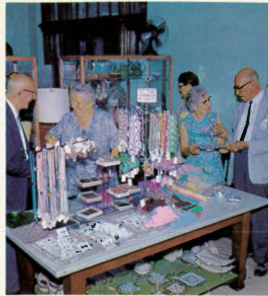
A corner of the Gift Shop where items made by the Guests in the Hobby-Craft Shop are for sale to visitors to the Homes.