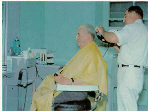
The Guest Fund provides for barber and facilities and that debonair appearance.