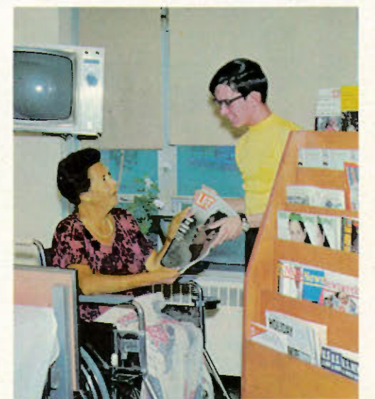
The current magazine and book cart makes frequent stops at hospital rooms. Another Guest Fund extra.