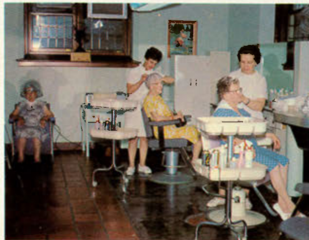
The very popular beauty parlor and beauticians made possible by Guest Fund.