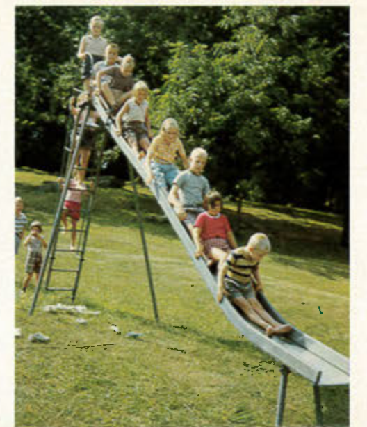
Recreational equipment, such as the popular sliding-board, shown above, are provided from funds in the Guest Fund.