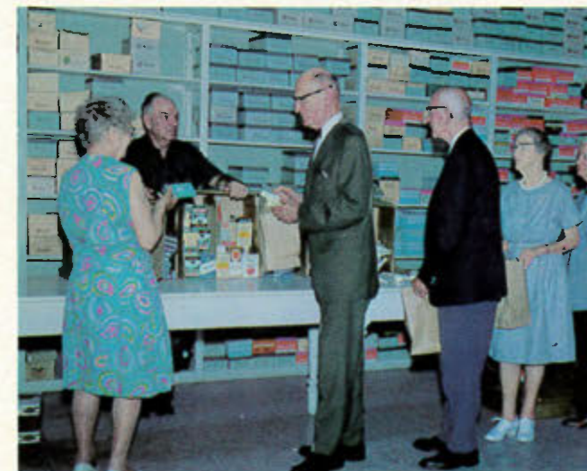
Guests lined up, paper bag in hand, and receiving sundry items provided by the Guest Fund.