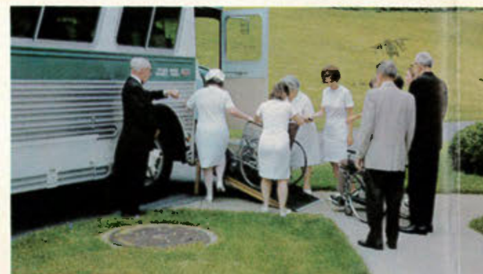
Even wheel-chair patients can enjoy an outing because of Guest Fund.