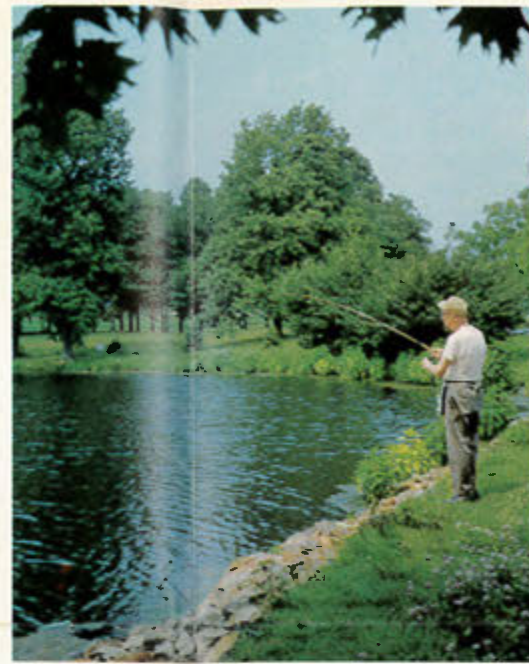
Enjoying the solitude at the well-stocked fish pond with fishing tackle furnished by the Guest Fund.

A modern swimming pool for young and old alike, with life guards, instructors and necessary maintenance is provided out of Guest Fund.