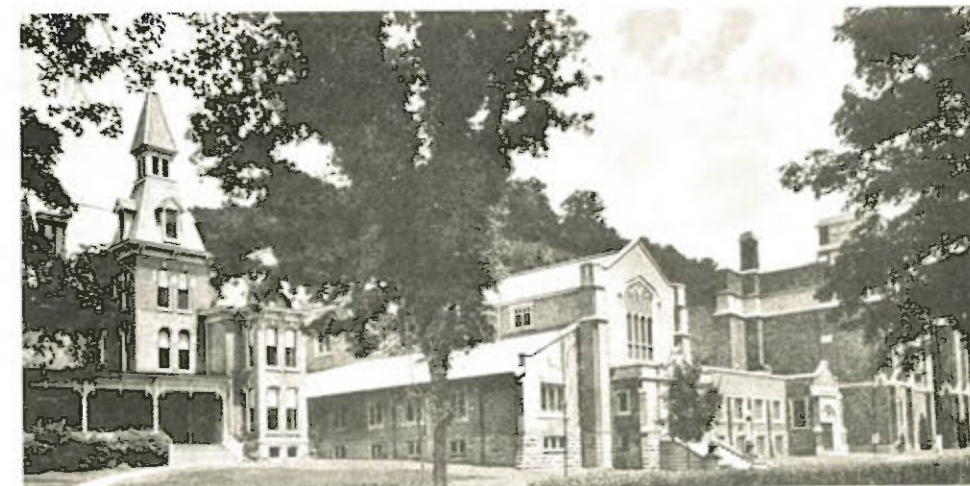
The Scottish Rite Cathedral, Coudersport, Pa., located in Potter County in North Central Pennsylvania, where the September Quarterly Communication of Grand Lodge will be held Wednesday, September 2, 1970.

The ten-year limitation shall not apply to those of the seven other members referred to above, who were serving as such on December 2, 1969."