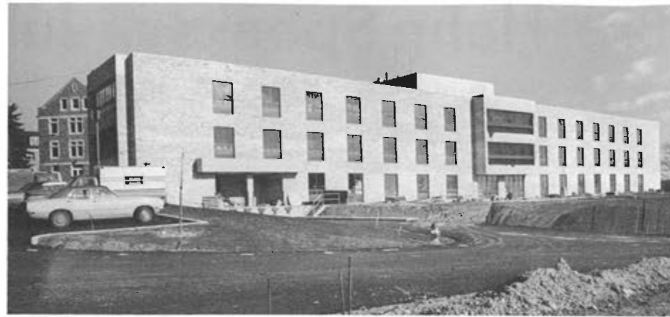
Two patio balconies in center at rear of new "Masons Care Building" above will enable Guests at Masonic Homes to sit outside to enjoy good weather and surrounding landscape. In bottom photo, tree stands like sentinel at main entrance to $3.5 million structure.

He was an upholsterer by trade and operated his own business in West Philadelphia for 66 years.