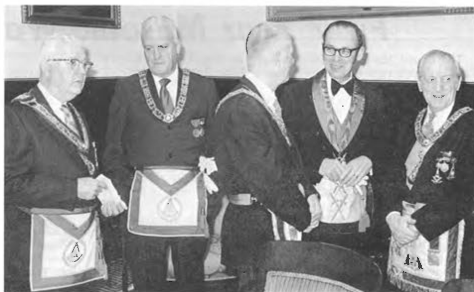
Grand Lodge Officers from many Jurisdictions, including the York Grand Lodge of Mexico, visited the Grand Lodge of Pennsylvania at the Annual Grand Communication Dec. 27, 1973.

May 26 — Grand Lodge Officers, meeting, Committee on Masonic Homes, Elizabethtown.