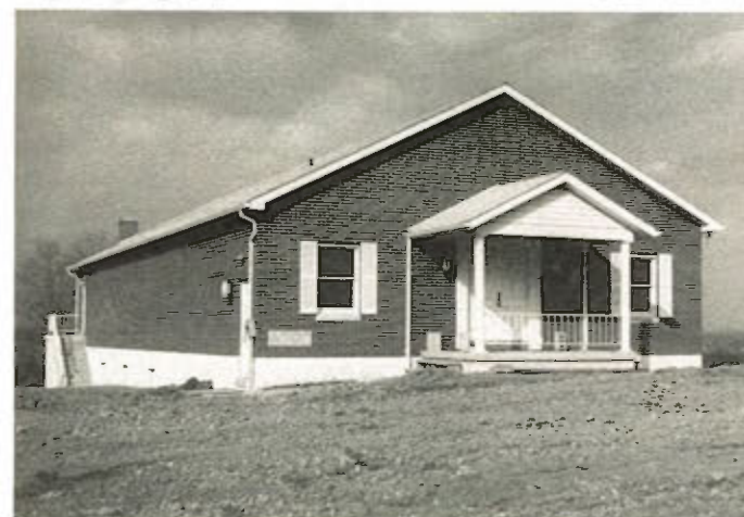
BUILT WITH MANY HANDS —Two photos showing the exterior and the interior of the new Masonic Temple of Blyth Lodge No. 593, West Newton. All manner of contributions and hours of labor of many of the Brethren are reflected in the completion of this beautiful and