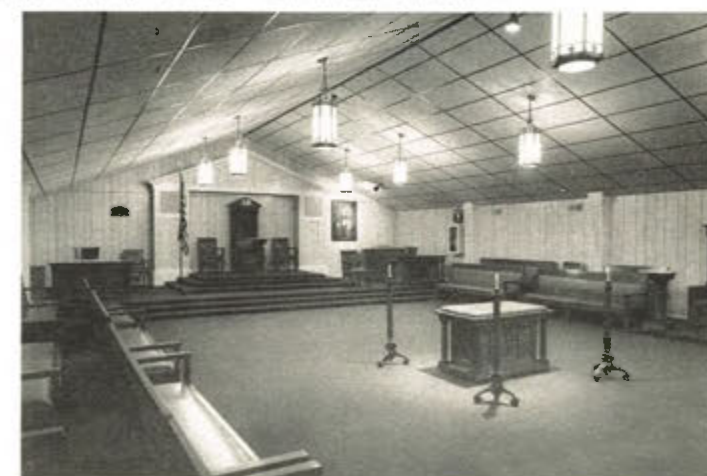
functional structure. The air-conditioned lodge room was dedicated at a Special Communication of Grand Lodge on Saturday, August 26, 1978.