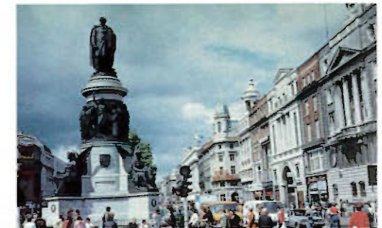
Take an optional tour to St. Stephen's Green, one of Dublin's most beautiful parks.