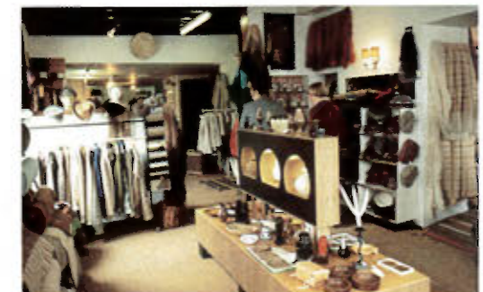
Shop just about anywhere for Waterford crystal, fine Irish linen and knits.