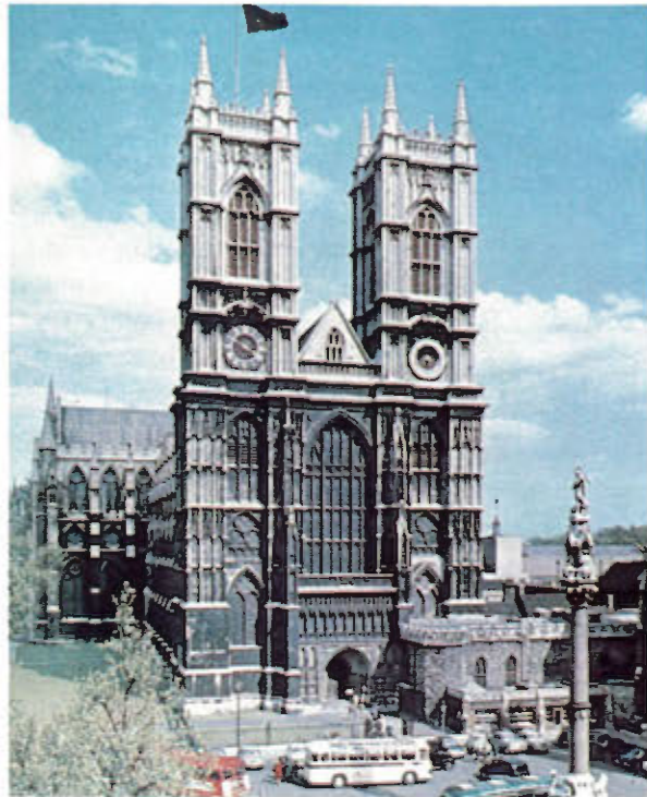
London, steeped in history, familiar traditions and heritage, where you can enjoy Big Ben, Buckingham Palace, Westminster Abbey, and more.

An exclusive invitation to members of the Grand Lodge of Pennsylvania (see next page)