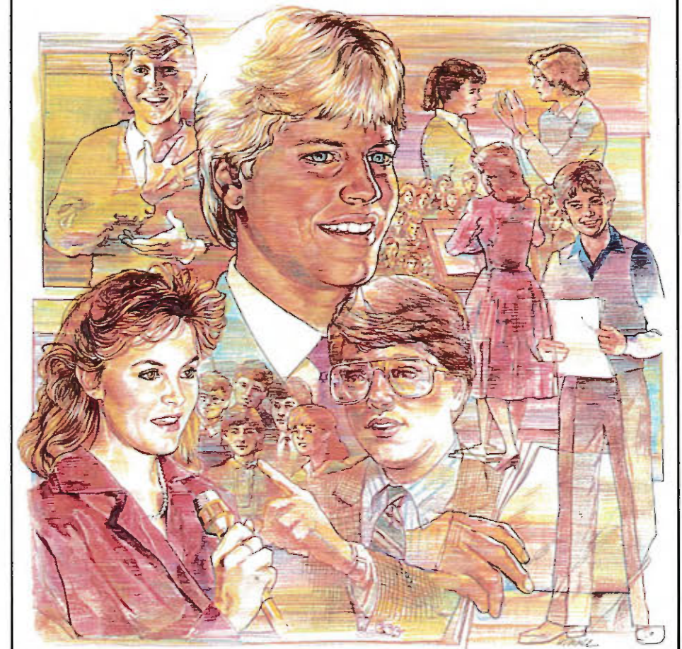
A SOLOMON II OUTREACH PROGRAM for Masonic-Related Youth Groups Developed in cooperation with the Pennsylvania Youth Foundation

It includes eight video cassettes and an instructor's guide and will be used to train the present members of a chapter, bethel or assembly, then used time and again as new members come into the organization each year.