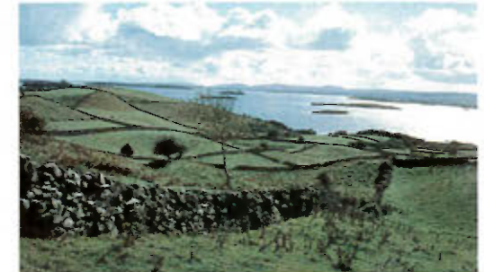
Stroll through winding paths in ancient Galway.