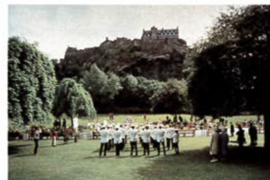
Travel throughout the English countryside by train to Glasgow where you will be enchanted by the rolling hills and the ruins of the majestic castles.