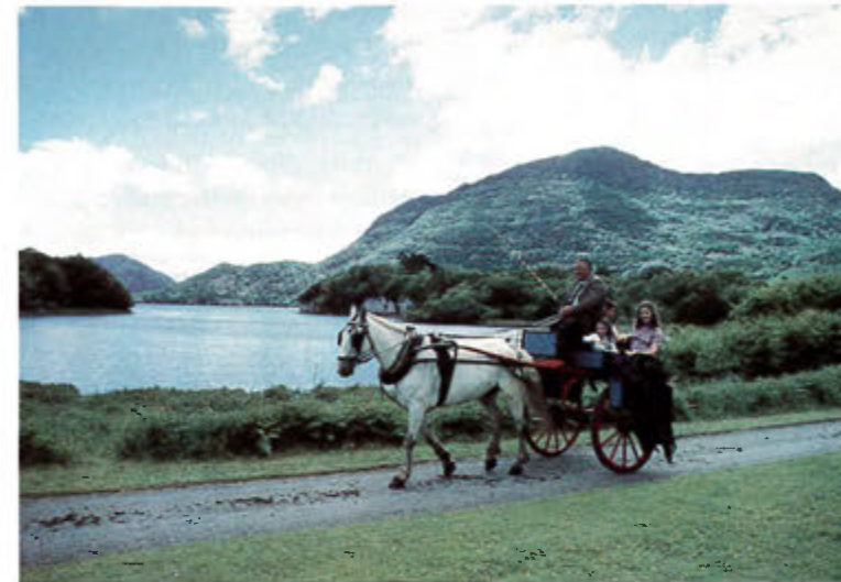
You can explore the most beautiful countryside in the world in your 4 nights in Limerick, visiting the wild landscape of Killarney.