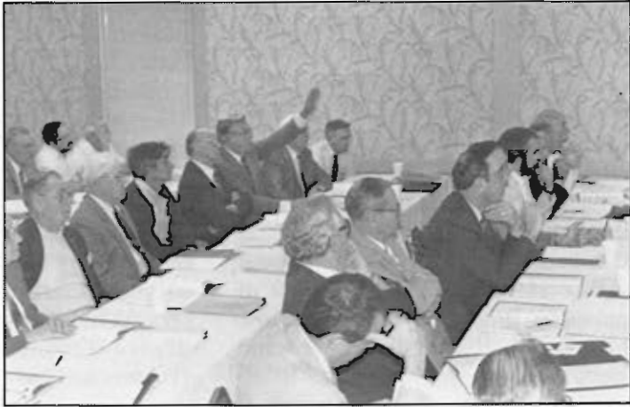
"Just one more question, Mr. Speaker. . ."

Shown here is the Secretaries Seminar held in Lewistown, Pennsylvania on October 24, 1987. Similar seminars were held in Philadelphia on November 21, 1987 and in Pittsburgh on December 5, 1987. Financial Seminars are being planned for the Fall of 1988 at each of our three Masonic regions with similar seminars for Secretaries being planned for the Fall of 1989.