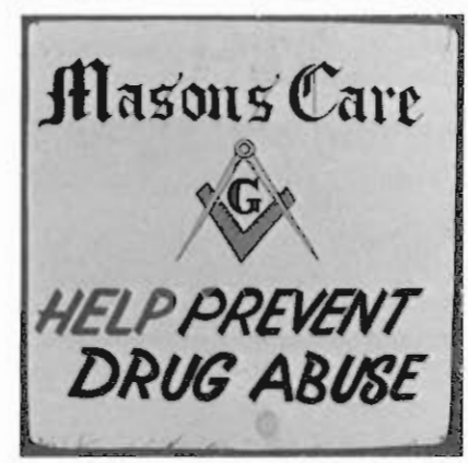
Moscow Lodge's Outreach

Moscow Lodge No. 504, Moscow, has taken a hint from the Masonic highway billboard program and is spreading the word that Masons are helping in the fight against drug abuse. They have adopted a smaller version of the sign and have installed it at the local little league baseball park. The Dandy Lion Little League, like other non-profit youth groups, is always in need of financial support. The selling of advertising signs on the outfield fence is one of their sources of revenue.