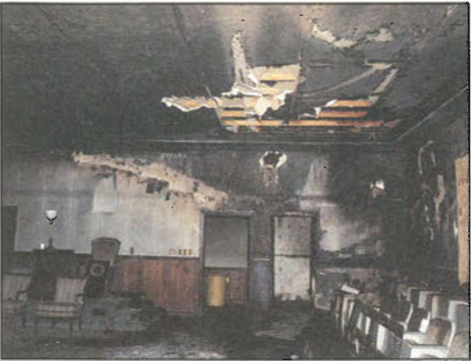
Before . . .