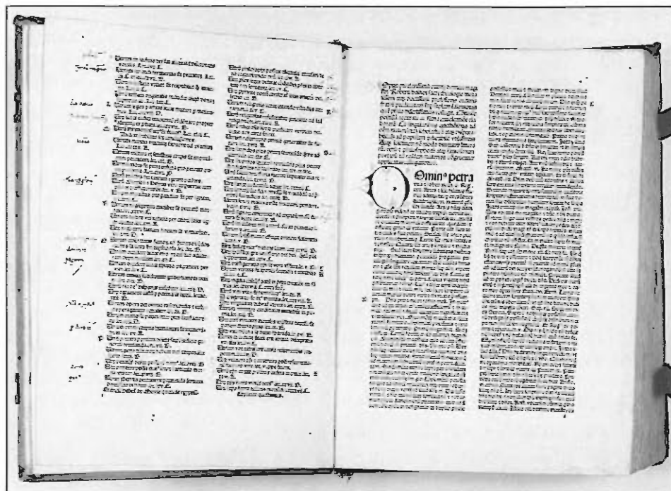
Five hundred year old illuminated book from the Grand Lodge library.

In the photograph, the book is open to the beginning of the main part of the Holkot work. Notice the marginal notes