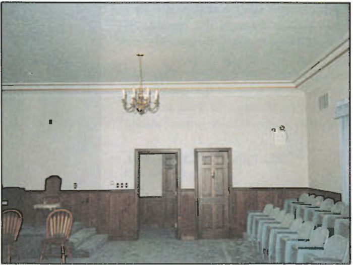
. . . and After