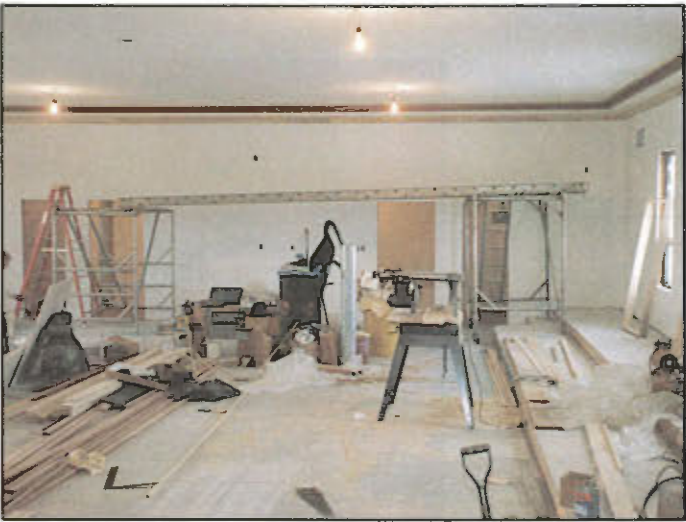
Hermitage Lodge, after a devastating fire, is back in business.

In the early morning hours of January 25, 1989. A rampaging 23 year-old arsonists, heavily damaged Hermitage Lodge No. 810 which meets in Hermitage, Pennsylvania, the fourth such fire in as many days. Police have arrested a 23 year-old who has confessed to the crime. The partially gutted, and heavily smoke and water-damaged Lodge, raised damage estimates to over $130,000.