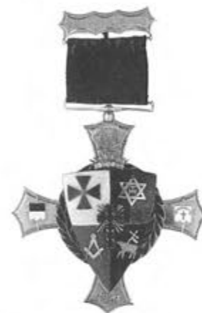
The Past Eminent Commander's Jewel

A box, or coffret, made in France of wood and dated 1820, features the Square and Compasses in the Fellow Craft