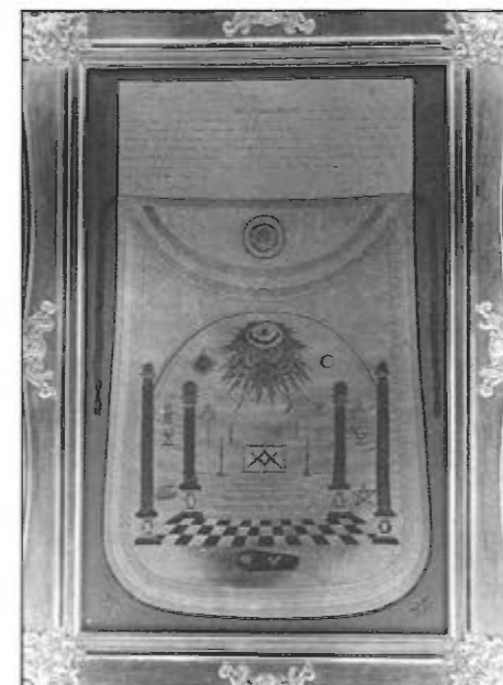
The Washington Apron