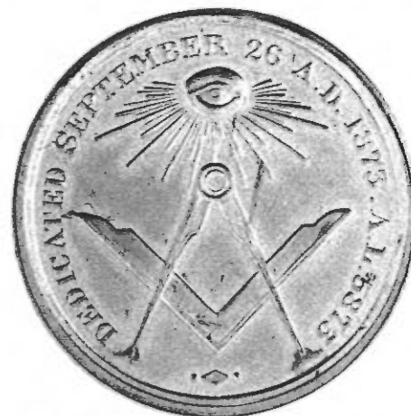
The Dedication Commemorative Coin