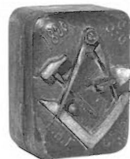
The French Masonic Coffret

Gavels through tableware and medallions to the pièce de résistance , the Masonic Apron made by Mme. de Lafayette for Bro. George Washington and presented to him by Bro. the Marquis de Lafayette.