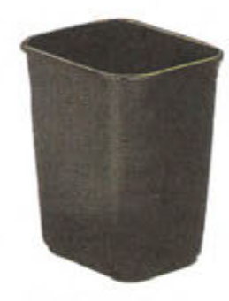
Wastebasket X5125 ..... $15.00