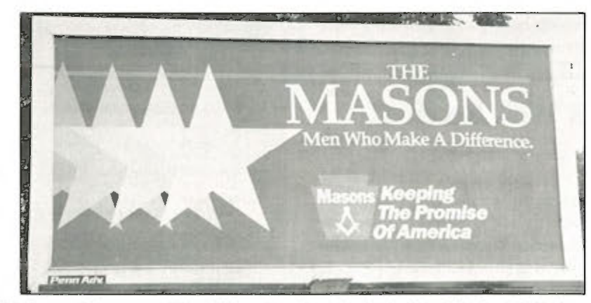
This is one of the eye-catching billboards on location in the Grand Lodge Public Awareness Program. The message has been seen already in some areas of Pennsylvania and, through the grassroots effort, should be seen statewide.

The goal of the Pennsylvania Masonic Awareness Program remains to revitalize our own pride in the values, commitment and leadership in our Fraternity at