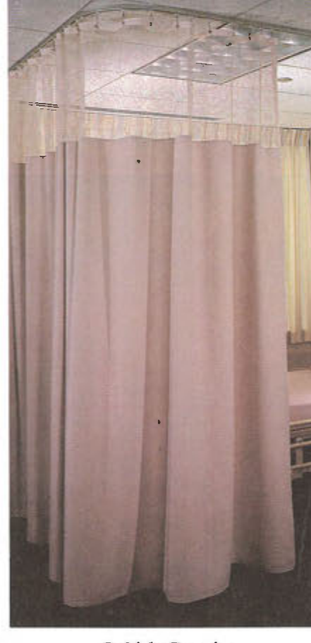
Cubicle Curtain X5140 ..... $330.00