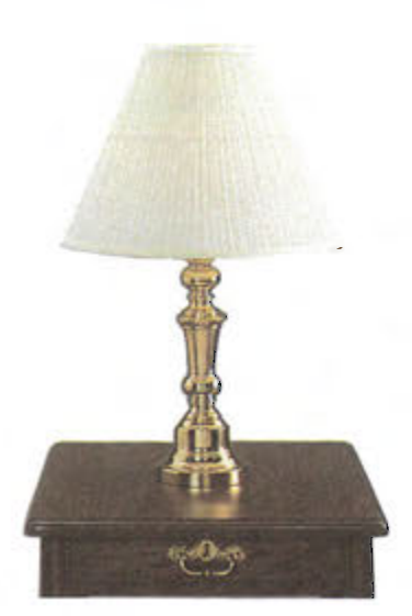
Table Lamp X505 . . . . . $106.00

Masonic Homes • Development Department One Masonic Drive • Elizabethtown, PA 17022-2199