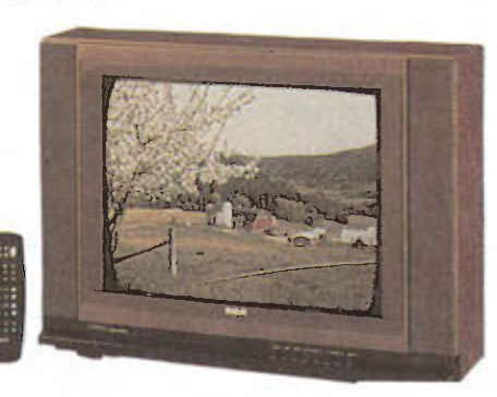
Colortrack TV with Stereo and Remote X510 . . . . . $600.00