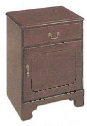
Bedside Cabinet with Pullout Drawer X5135 . . . . $275.00