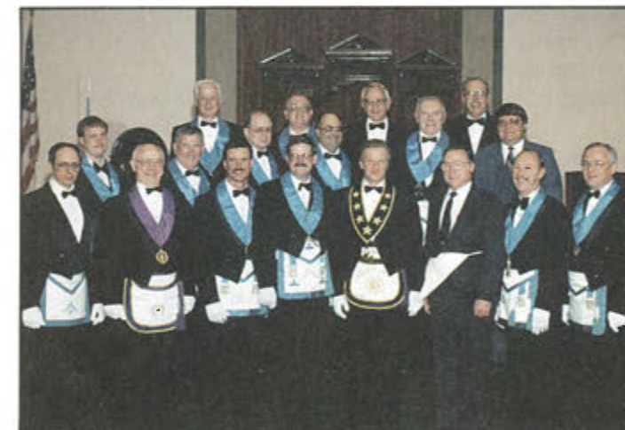
Fellowcraft Mason's Degree Team