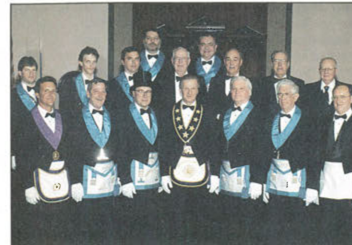
Entered Apprentice Mason's Degree Team