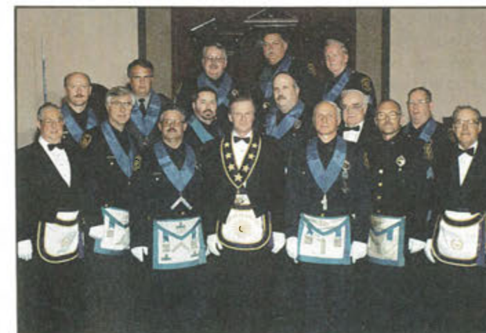
Master Mason's Degree Team