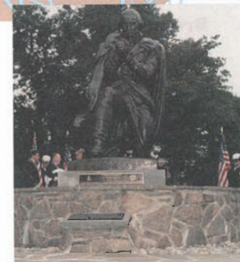
Valley Forge (see story on page 16)