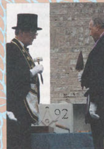
Elizabethtown (see story on pages 9-11)