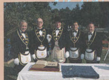
Perryopolis (see story on page 18)