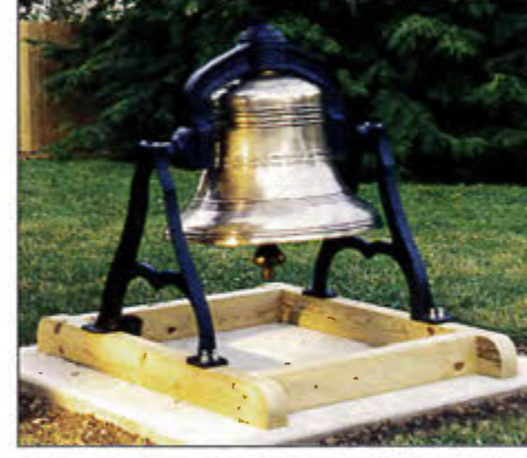
The recently restored Meneley Bell years ago called the young boys of the Brown Home to dinner, now rests next to the new Children's Home

Many years ago when the Brown Home was a boys' dormitory, a large bell would toll, and the boys had five minutes to return to the building from play. That bell will now be preserved for future generations at its new home near the Children's Home buildings. The "Meneley Bell" was cast in 1921,