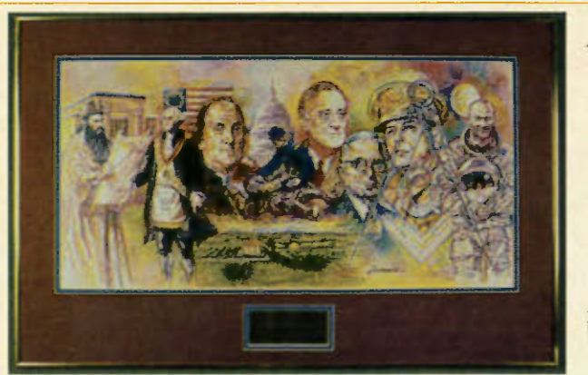
This unique art depicts King Solomon and some of the most famous Freemasons of all time. Prints are double matted with engraved plate, "Friend to Friend – From Centuries Past Through Centuries to Come," glass mounted and gold framed with a wire hanger.