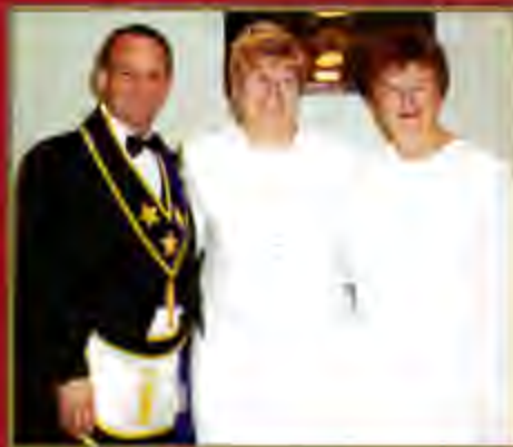
A woman is presented with a memento during the dinner.