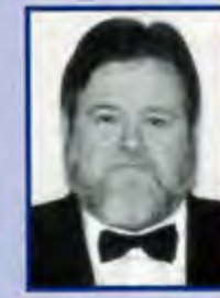
Rev. Paul E. Moats Lodge No. 232, D-18, R-6