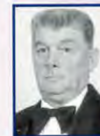
MASONIC DISTRICT 23 William R. Fielding Lodge No. 754, Region 5 Presentation: Jan. 12, 2006