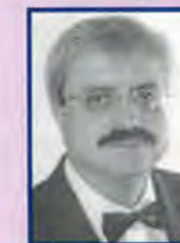
MASONIC DISTRICT 38 Robert F. Dunkle Lodge No. 548, Region 4 Presentation: Jan. 16, 2006