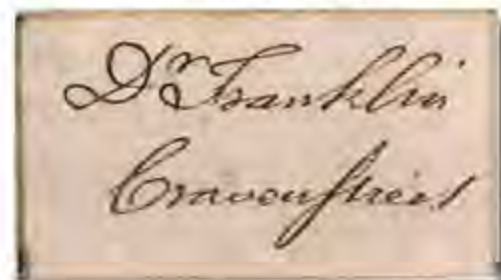
Bro. Franklin's calling card