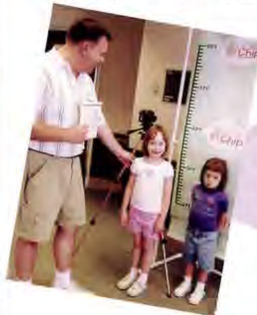
Left- The important work of our fraternity with CHIP, the Student Assistance Program (SAP), DARE, and other key programs will also continue.

Pennsylvania Masonic Youth Foundation 1244 Bainbridge Road Elizabethtown, PA 17022-9423 (717) 367-1536