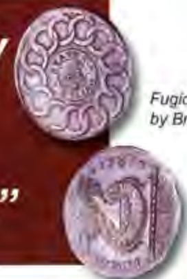
Fugio coins, designed by Bro. Franklin