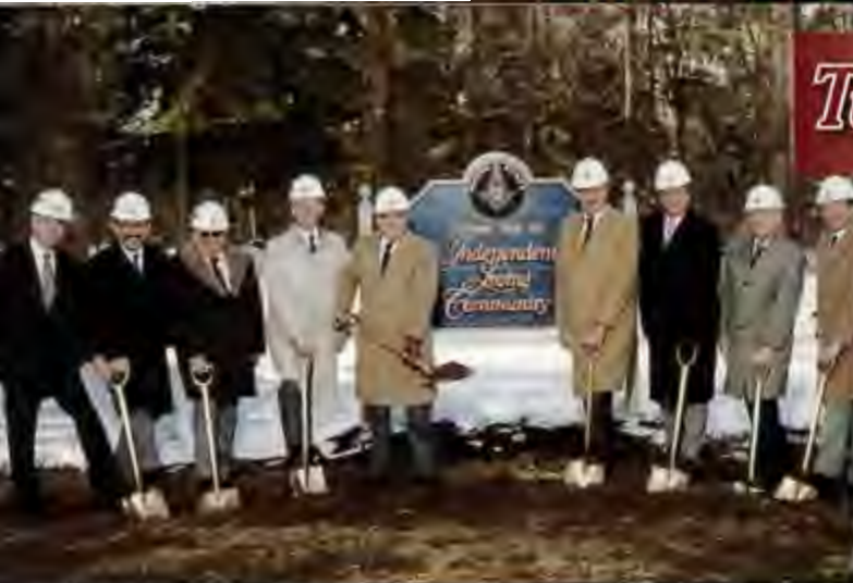
Groundbreaking ceremony for the original Independent Living Community in Elizabethtown