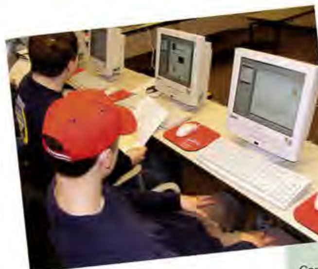
Left- Quality training will still be offered to youth and adult leaders alike, such as those offered to these participants in a recent publication seminar. Right- The adventure-based learning of the LifeSkills and LifeChangers

Conference will also continue in the new foundation.