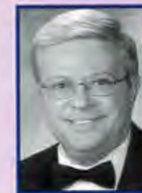
MASONIC DISTRICT 24 Richard N. Fitzsimmons Lodge No. 392, Region 5 Presentation: Jan. 6, 2006