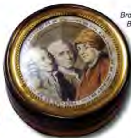
Bro. Franklin is pictured on this snuff box with Bro. Voltaire and Jean-Jacques Rousseau