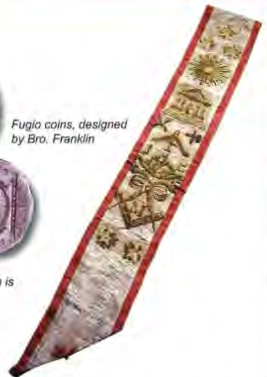
The Masonic sash which is purported to have been Bro. Franklin's.