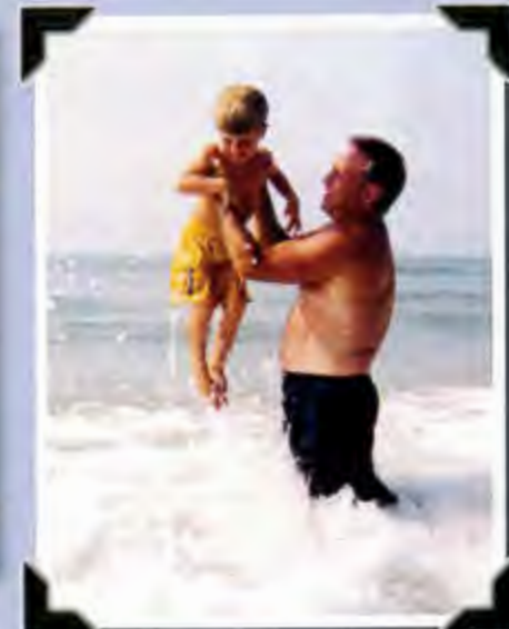
Top, left to right: