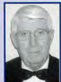
W. Jack Yates Lodge No. 408, D-25, R-5